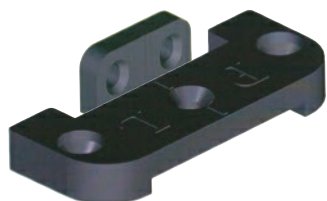
Lock With Centre Screw